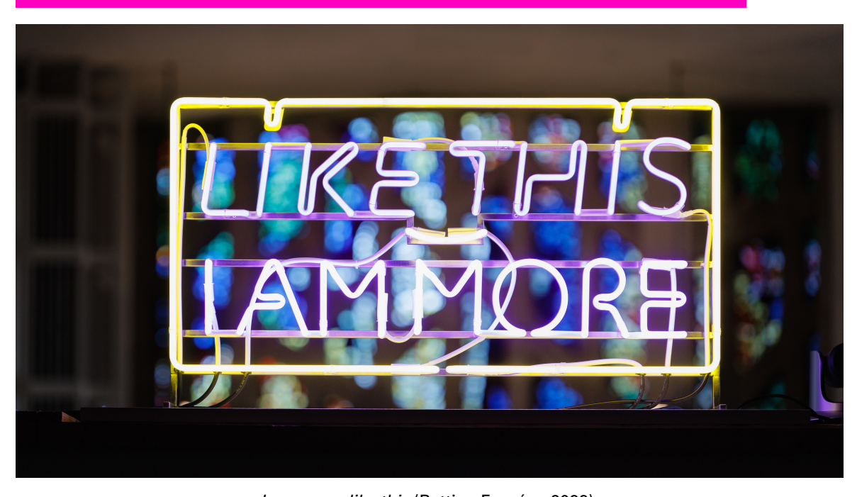
I am more like this (Bettina Furnée , 2022).